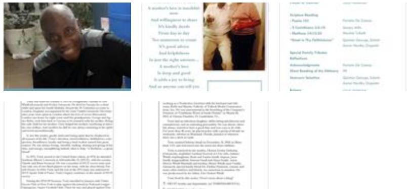
Marshall-March Funeral Homes - August 21, 2020 at 10:23 AM

“ 14 files added to the album Terrance E. Whall