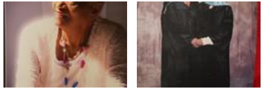
Mercedes - August 22, 2023 at 01:16 PM